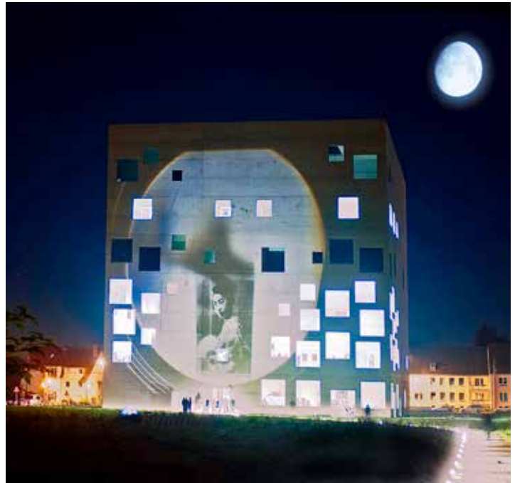
The Dream Of The Japanese Beauty, opening of the c.a.r. 09, the contemporary art Ruhr