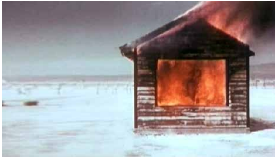
Mannaka No Ie (The House In The Middle) 7 min 50s, 2006